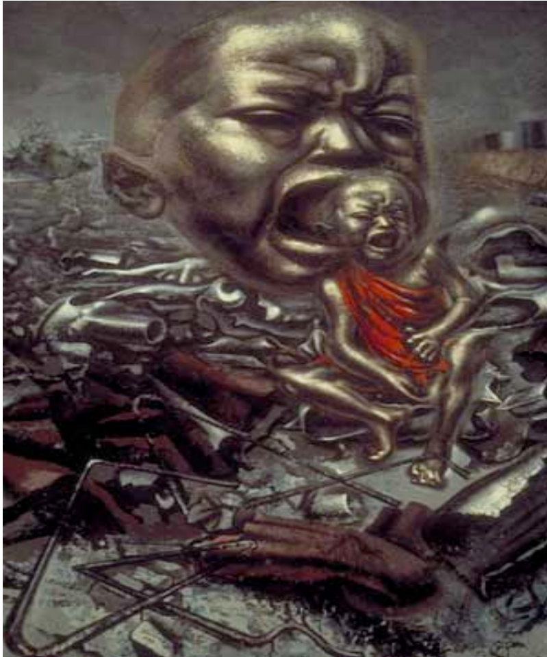
Echo of a Scream by David Alfaro Siqueiros

An ancient proverb says, “A picture is worth a thousand words.” Regardless of the artist’s original intent, what we see in the picture can be very different from what others see. What words would you use to describe what is happening in this picture? Write a story using Echo of a Scream as inspiration. Use your imagination and life experiences to speculate what the story is about and include characters, setting, theme, and plot. Refer to individual and class notes on description, analysis, and interpretation of the artwork to trigger creativity.